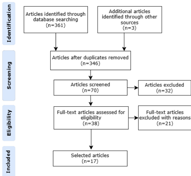
Figure 1. Prisma Work Flow

This study uses a Systematic Literature Review (SLR) approach to analyze relevant literature related to the contribution of digital transformation to smart city maturity. SLR was chosen because this method allows researchers to systematically identify, evaluate, and synthesize existing findings in the literature, thus providing a strong basis for drawing valid and relevant conclusions. The SLR process in this study follows the PRISMA (Preferred Reporting Items for Systematic Reviews and Meta-Analyses) framework [13], which provides structured guidance for each study stage, as seen in Fig 1.